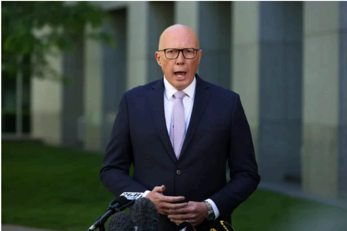
Opposition Leader Peter Dutton.

Speaking amid a campaign-style blitz on Labor seats this week, Mr Dutton confirmed the Coalition's modelling will say nuclear power is cheaper over the long run than Labor's plans to achieve 82 per cent renewable energy in the grid by 2030.